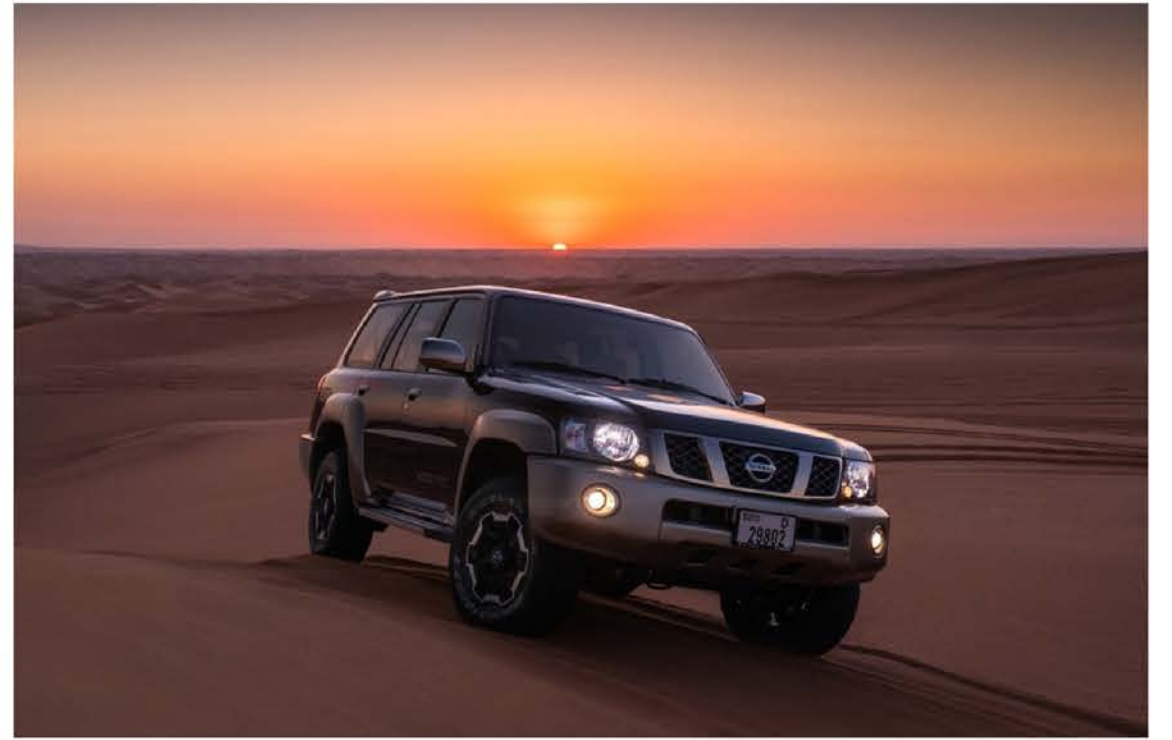
Nissan Patrol Super Safari