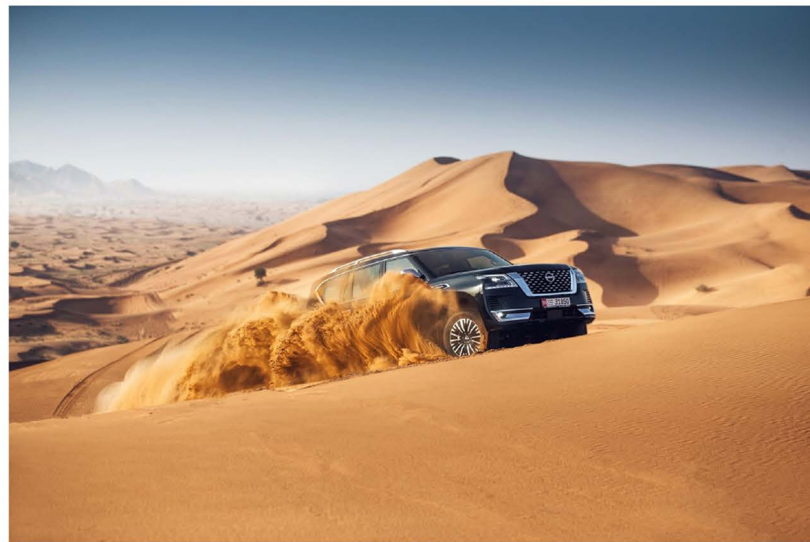
Nissan Middle East 2020 Library | UAE 2020