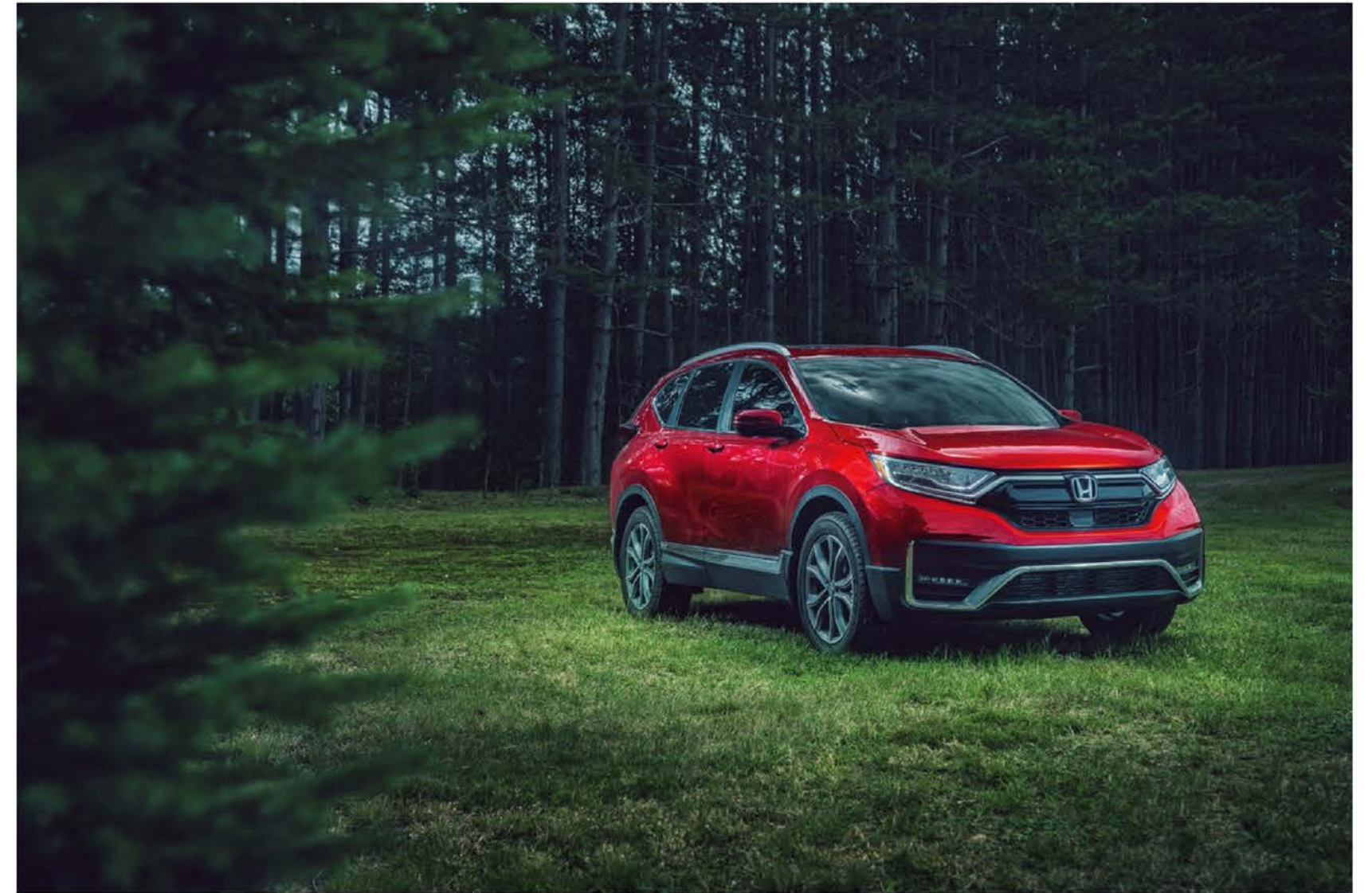
Honda Passport Honda CR-V