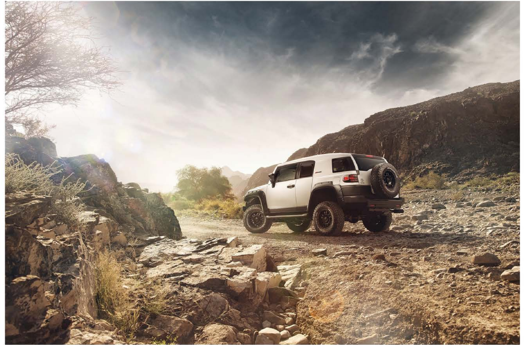
Nissan Patrol Super Safari