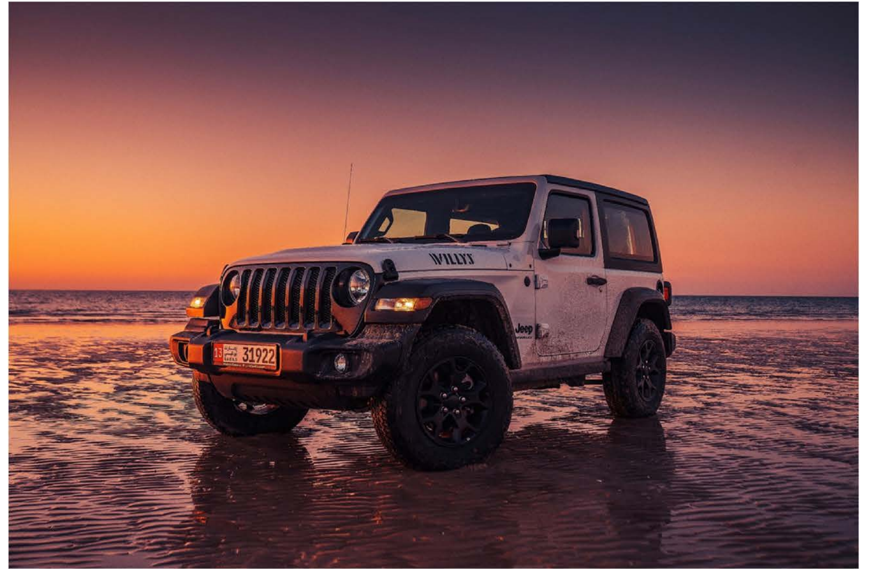
Jeep Abu Dhabi Adventure Calling Campaign | Abu Dhabi 2020